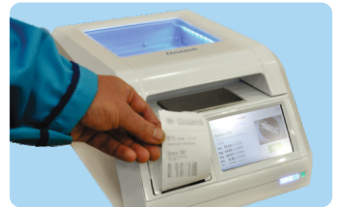
4. Display results & print report