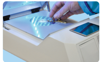
2. Put sample on the analytical window