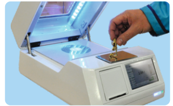
1. Put sample on the weighing scale