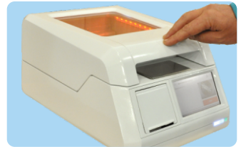
3. Close the lid. Analysis starts automatically